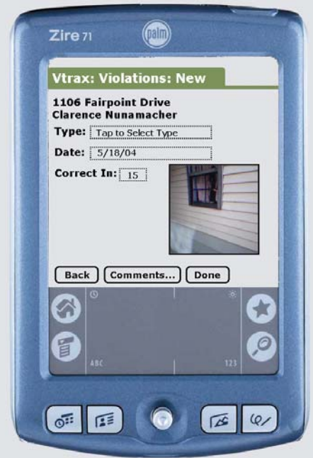
*Also supports Palm Zire 72 Palm Zire™ 71 Copyright © Palm, Inc.

Budgeting and Reporting - WLConnect™ keeps comprehensive records of all expenses and income to provide a single point of reference, improving budgeting accuracy. WLConnect™ incorporates reporting tools that quickly and easily answer the age-old question: "Where do my assessments / dues go?"